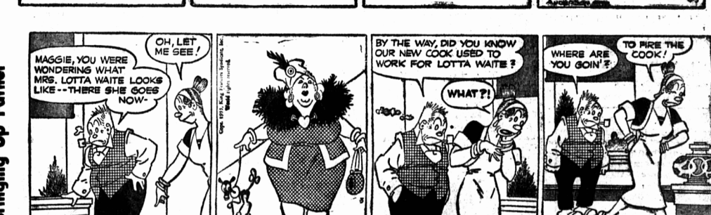
By George McManus