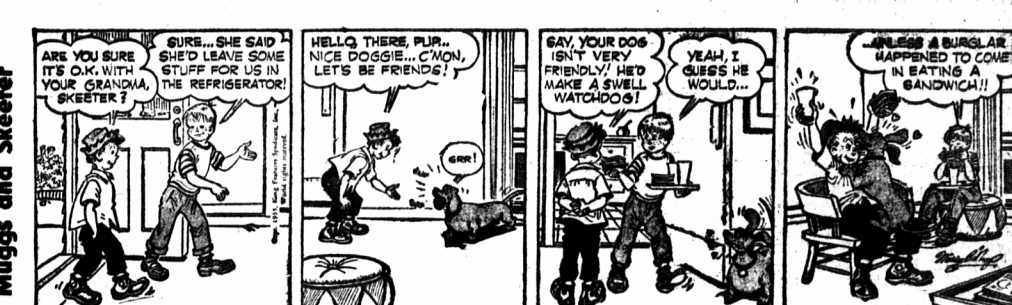
By Wally Bishop