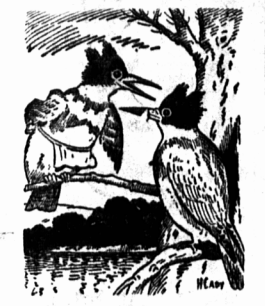
"That is really too bad," said Mrs. Rattles.

Obdurate is a big word for small folks but when you know just what it means it doesn't seem so big. It means being stubborn. It means making up your mind to something, and not owing anything to change your mind.