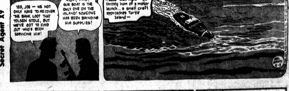
By Mel Graff