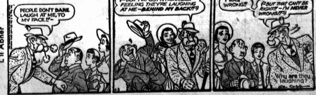
By Al Capp