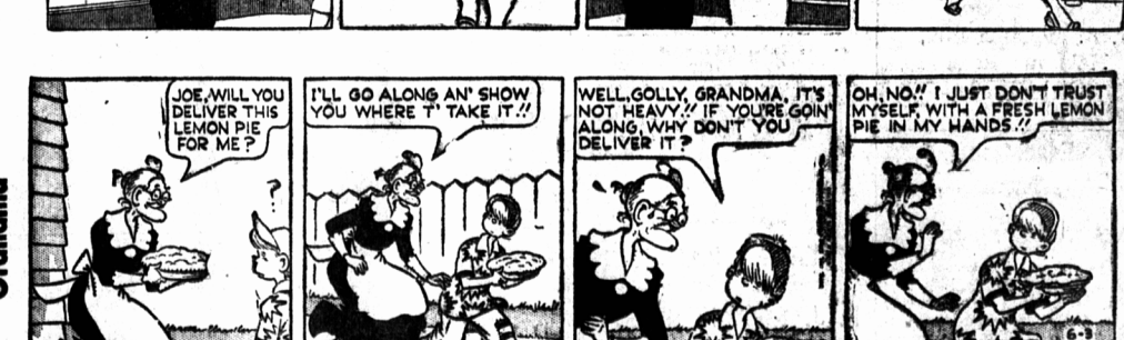
By Charles Kuhn