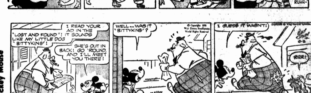
By Walt Disney