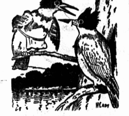
"That is really too bad," said Mrs. Rattles.

to Vietnamese forces for the first time in nearly a century. The security of the city was turned over to the commander of the first Vietnamese military region.