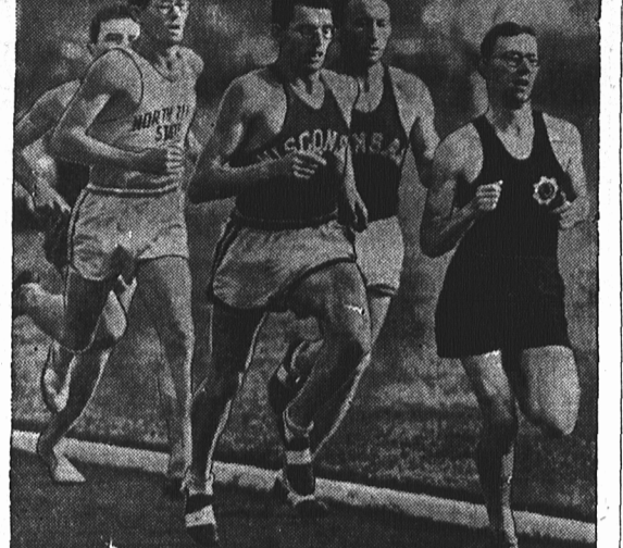
When the field jammed up like this on the heels of Sydney Wooderson, British track ace, it eventually cost him his chance for victory after he had led from the start in the climatic mile race at the annual Princeton track meet. Blaine Rideout (second from left above), of North Texas State, accidentally bumped Wooderson in an effort to pass him, and he fell with the result that the Englishman finished last. Chuck Jenke (running second, above) won, Glen Cunningham (third above) took second place, Archie San Romani (fifth above) was third, and Rideout came fourth.