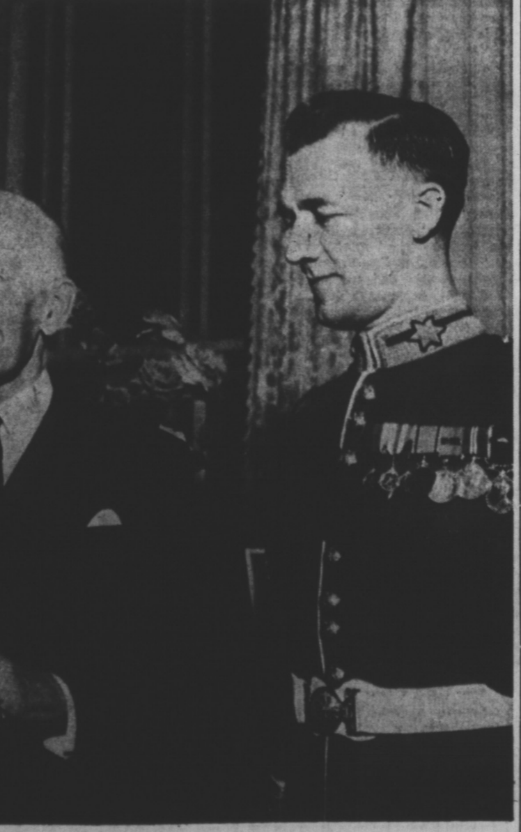
HONORARY MESS MEMBER

MOSCOW (AP) — Diplomatic sources said Monday night the Soviet Union is reopening more of the travel routes it closed to foreigners last week. Two Americans and one Briton are heading for the northern port of Archangel today and one or two other members of the U.S. Embassy staff may go to Archangel Wednesday after delayed approval of their applications.