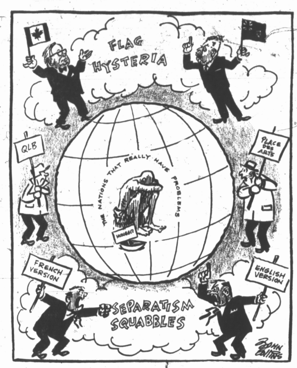
"--SEE OURSELVES AS OTHERS SEE US"

The Australian cities of Sydney, on the east coast, and Perth, 2,300 miles to the west, are to be linked by a new standard gauge railway to be completed in 1968.