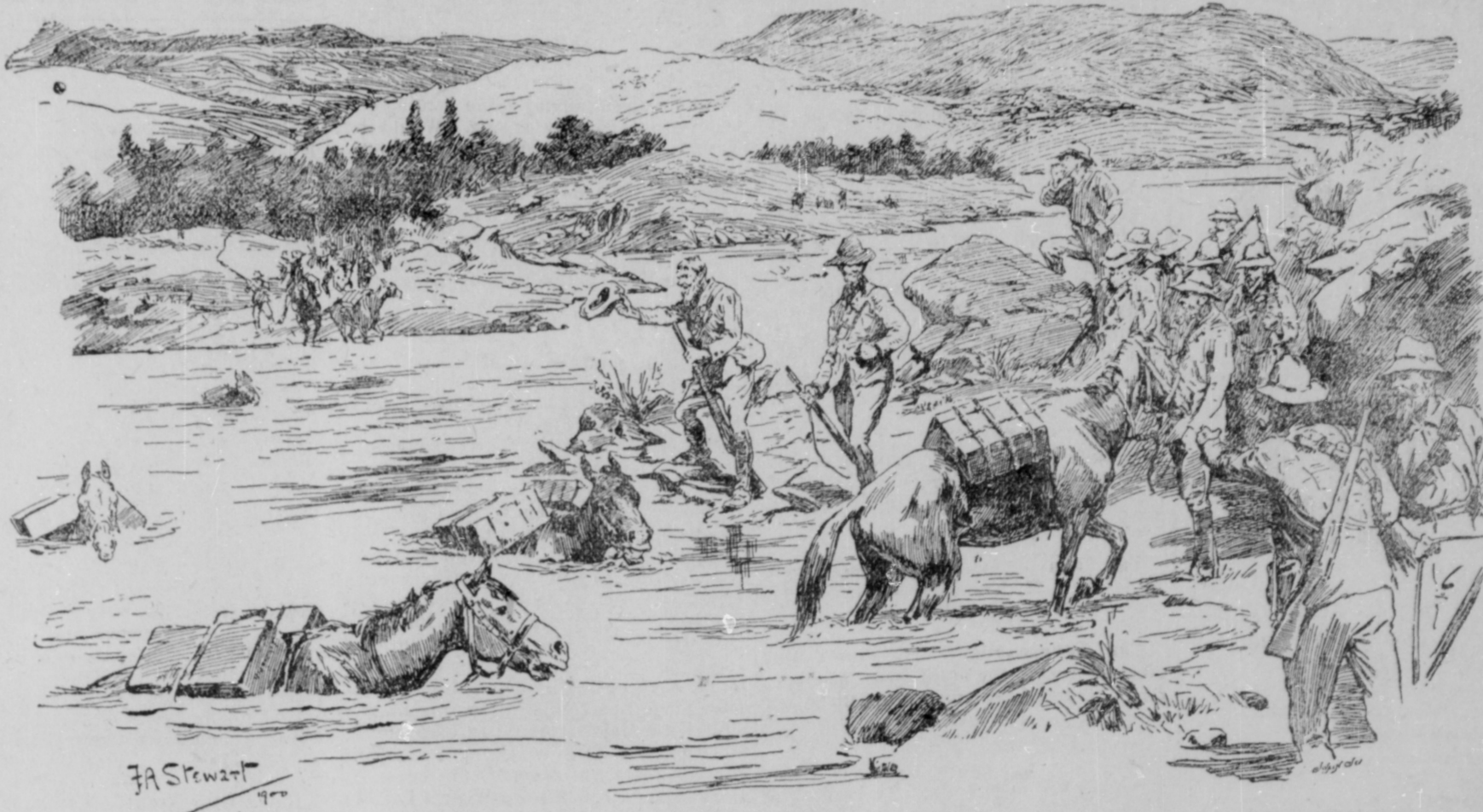
THE RISING OF THE TUGELA. The River Having Risen Owing to the heavy Rains, a Number of the Boers Were Cut off by the Breaking of Their Wooden Bridge. The Picture Illustrates the Boers getting Supplies Over by Means of Pack-Horses Swimming the Stream. There Were Supposed to be 3000 of Them Occupying Hiangwani Hill Forming the Left of Boer Position at Colenso.

cures CERO NIC-DISEASES and RUPTURE by Salisbury treatment. Send stamp for information, or call at Tupper, Nova Scotia, or Victoria Bank of Halifax Building.