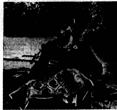
The Queen Mary Carpet is now in Charlottetown and Prince Edward Islanders may see the Queen Mother's contribution to Britain's post-war effort in its place of honour in our Confederation Chamber.