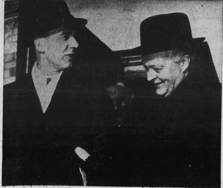
PREMIERS STANFIELD AND LESAGE AT SOD TURNING CEREMONY