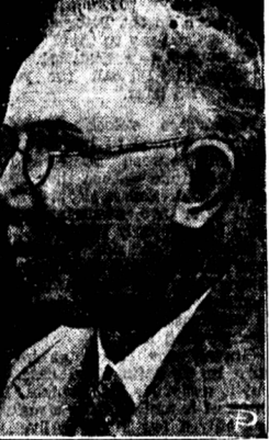
RT. HON. J. H. THOMAS Secretary of Colonies who resigned from the British Cabinet, following an inquiry into the alleged "budget leak."