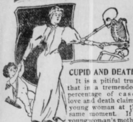
CUPID AND DEATH.

It is a pitiful truth that in a tremendous percentage of cases love and death claim a young woman at the same moment. If a young woman's mother does not feel competent to give her daughter the right advice about how to keep herself well and strong in a maidenly way, she should seek the advice of some physician of wide experience, and of substantial reputation. A young woman naturally does not like to be a subject of discussion, examination and the horrible local treatment of a home doctor. Moreover, obscure physicians make the mistake of attributing her ills to indigestion, or heart or liver trouble, when the real cause is weakness or disease of the delicate organs concerned in wifehood and motherhood.