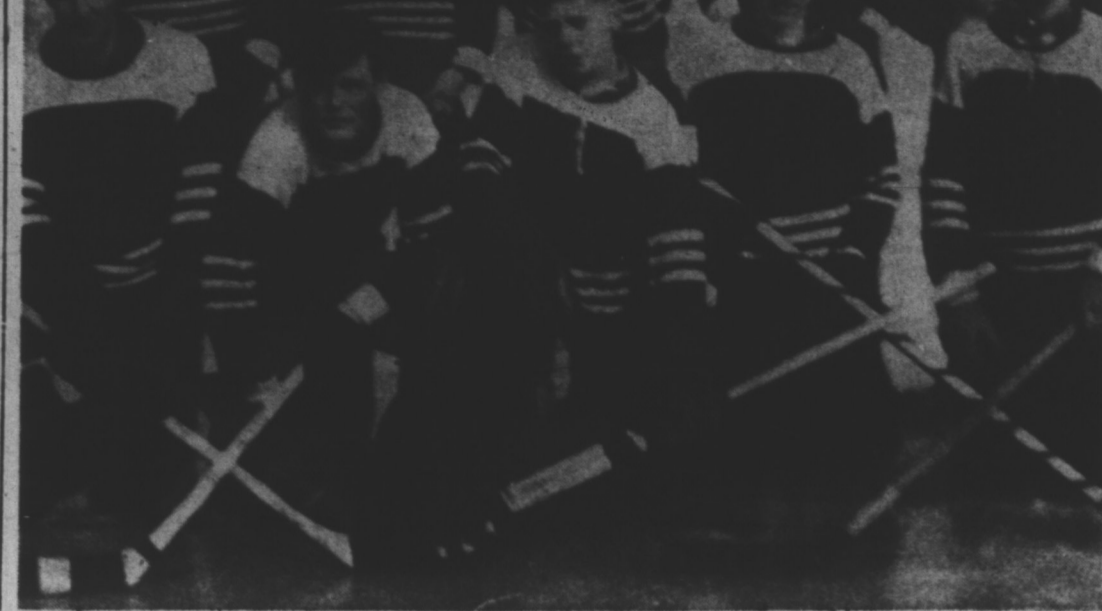
WEST PRINCE WINNERS

He said his progress seemed slow to him but the doctor told him such things take time.