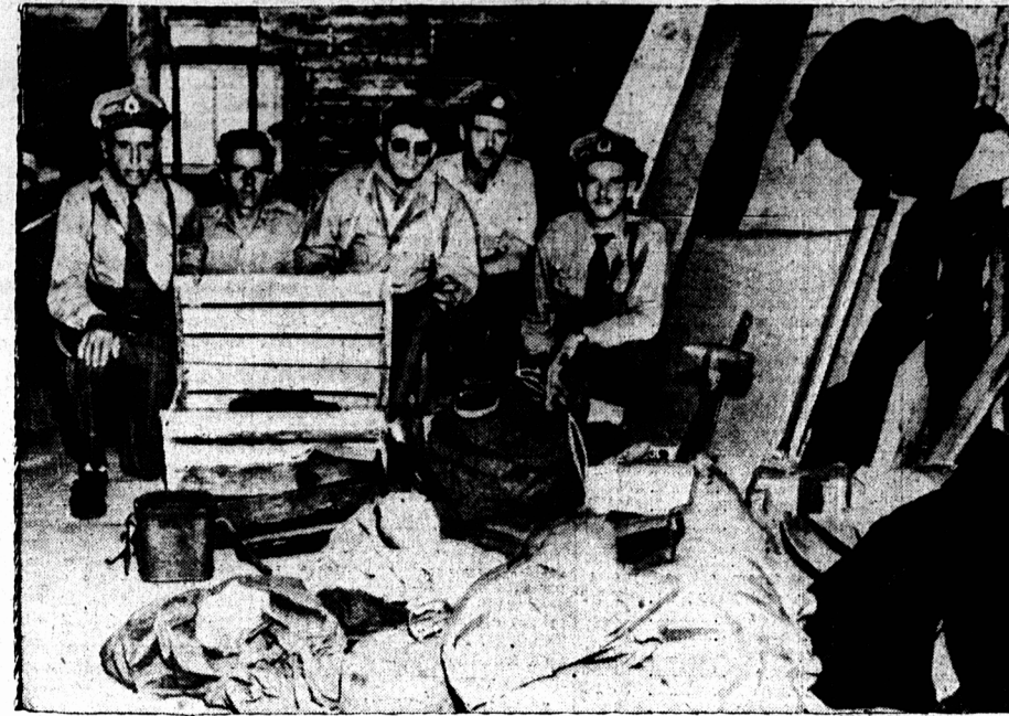
Equipment and clothing collected in the Gaspé wilds are examined by police searching for an answer to the disappearance of three U. S. bear hunters. One skeleton, headless, has been found. The clothing, a blood-stained rifle and two sleeping bags were found near the skeleton. Police at first thought it was the body of a man killed by bears but now discount that theory.