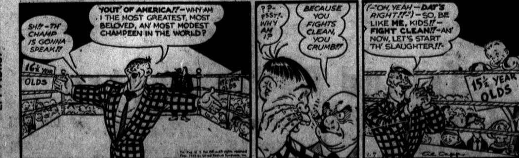
By Ham Fisher Lit Abner