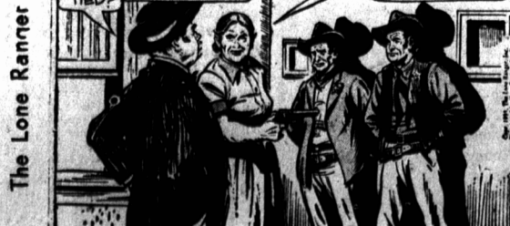
The Lone Ranner