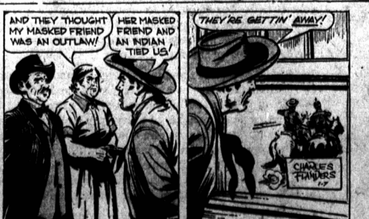
By Fran Striker