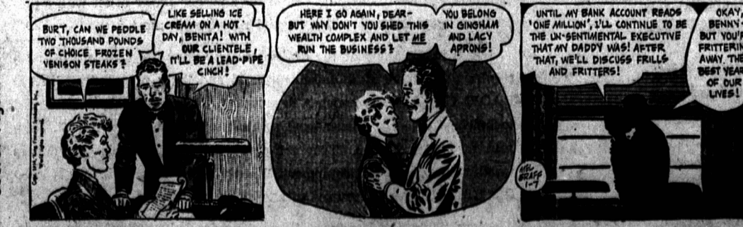
Secret Agent X9