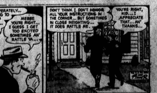
By Al Capp