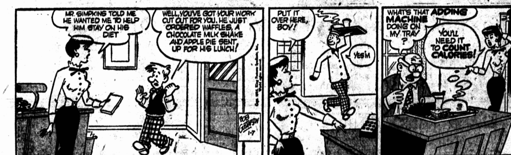
Tilly The Toiler