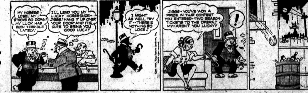
Bringing Up Father