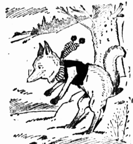
He sat down and studied the snow around him.

This is true all the time, and everywhere. It is true with boys and girls, and with grownups. It is true with all the Green Forest, and all the Green Meadow folk. All his life Reddy Fox has taken heed of little things. Very little escapes those sharp eyes of his. His quick ears catch all the little sounds, and these tell him many things. His keen nose is always busy picking up all the different scents wherever he goes. So it is that Reddy knows from all these little signs what is going on about him. He isn't easily fooled. No sir, Reddy isn't easily fooled.