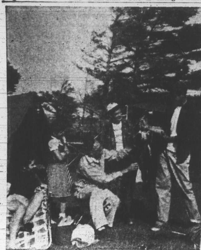
SHORE FRONT campgrounds located near deep-sea fishing spots can provide the angler with ample opportunity to wet a line. Here a young camper proudly displays the fish he caught at the nearby shore.