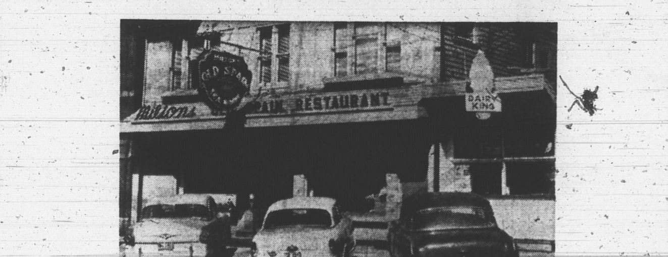
The finest in good eating... featuring nine dinner menu specials daily. Tender steaks... delicious sea foods... plus other appetizing dishes. Everything's so good you'll make us your dining headquarters while on The Island.