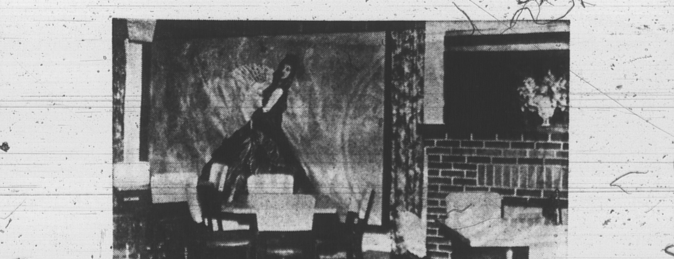
A fully licensed club with entertainment nightly... plus a full course menu for your dining pleasure. Located above the Old Spain Restaurant, the Horse and Sulky Club's Granada Steak Lounge is open afternoons also.