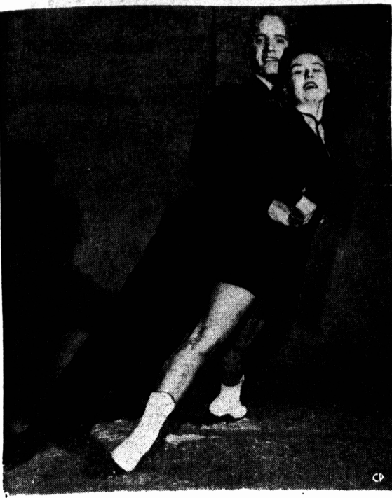
Frances Dafeo and Norris Bowden of Toronto are pairs figure-skating champions of the world. They won the title in competition at Oslo last year they won the Canadian and North American pairs title. This photo was taken just before their departure from Canada for the international competition.