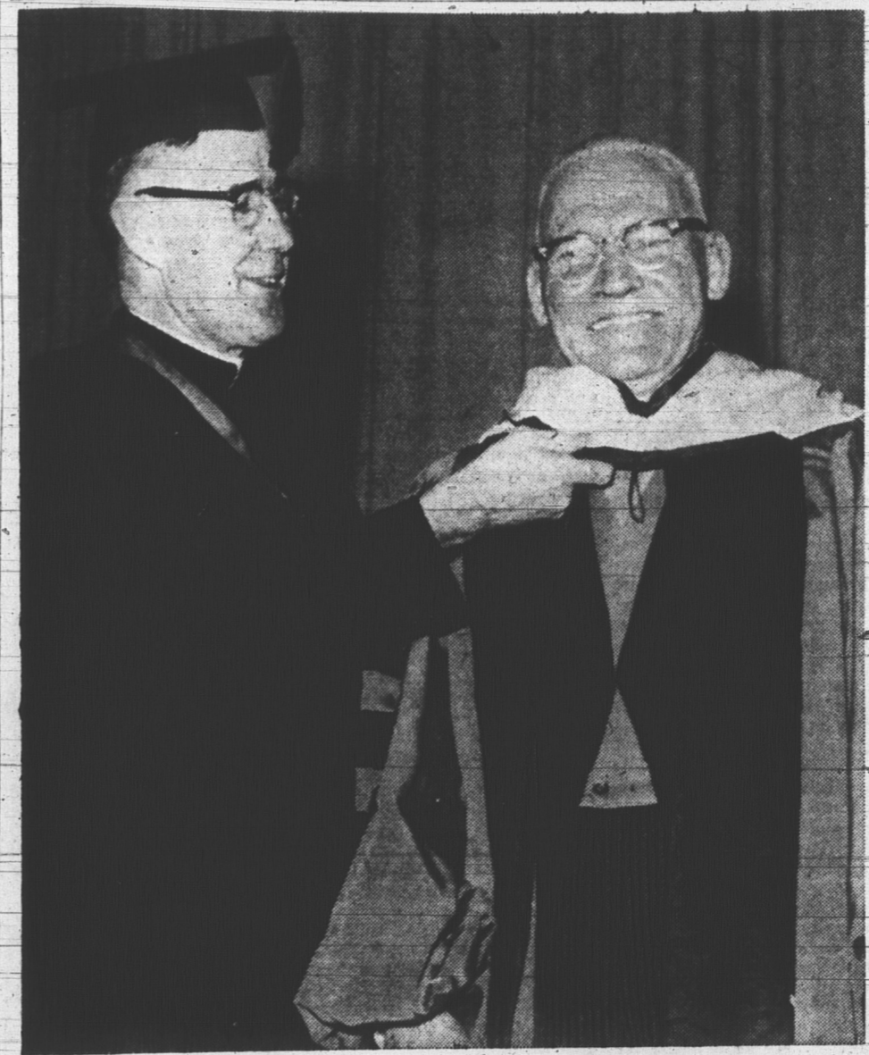
HONORARY DEGREE CONFERRED

About 95 per cent of the lobster traps at St. George's Bay were reported destroyed.