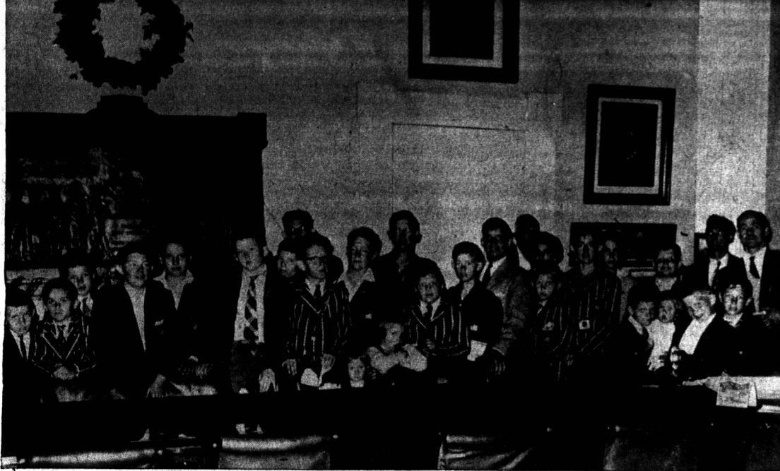
ONTARIO SCHOOL DISCOVERERS VISIT