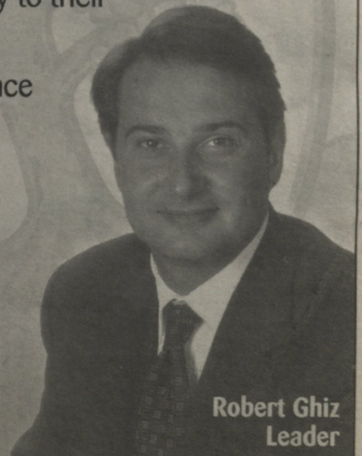
Robert Ghiz Leader