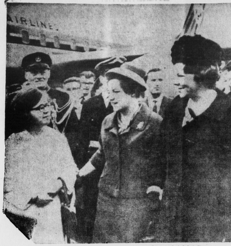
DUTCH PRINCESS HOME FROM CANADA

Bennett Likes Pension Plan VICTORIA (CP) — Premier W.A.C. Bennett said here he is pleased with new Canada Pension Plan proposals he has received from Prime Minister Pearson. Mr. Bennett said the prime minister has sent him a 7½-page telegram on the pension plan and "other fiscal matters." The premier said he couldn't divulge contents of the telegram since it was marked "personal and confidential." But he told reporters, "you can see I'm smiling." WAITED FOR SUN Salado Indians of Arizona began spring planting or fall harvesting when the sun shone directly through two small apertures on opposite walls of a four-story tower. FIND NEW PRIMITIVE A newly identified species of primitive man, homo habilis, of which the first appeared in Tanzania 2,000,000 years ago, has been discovered in East Africa.