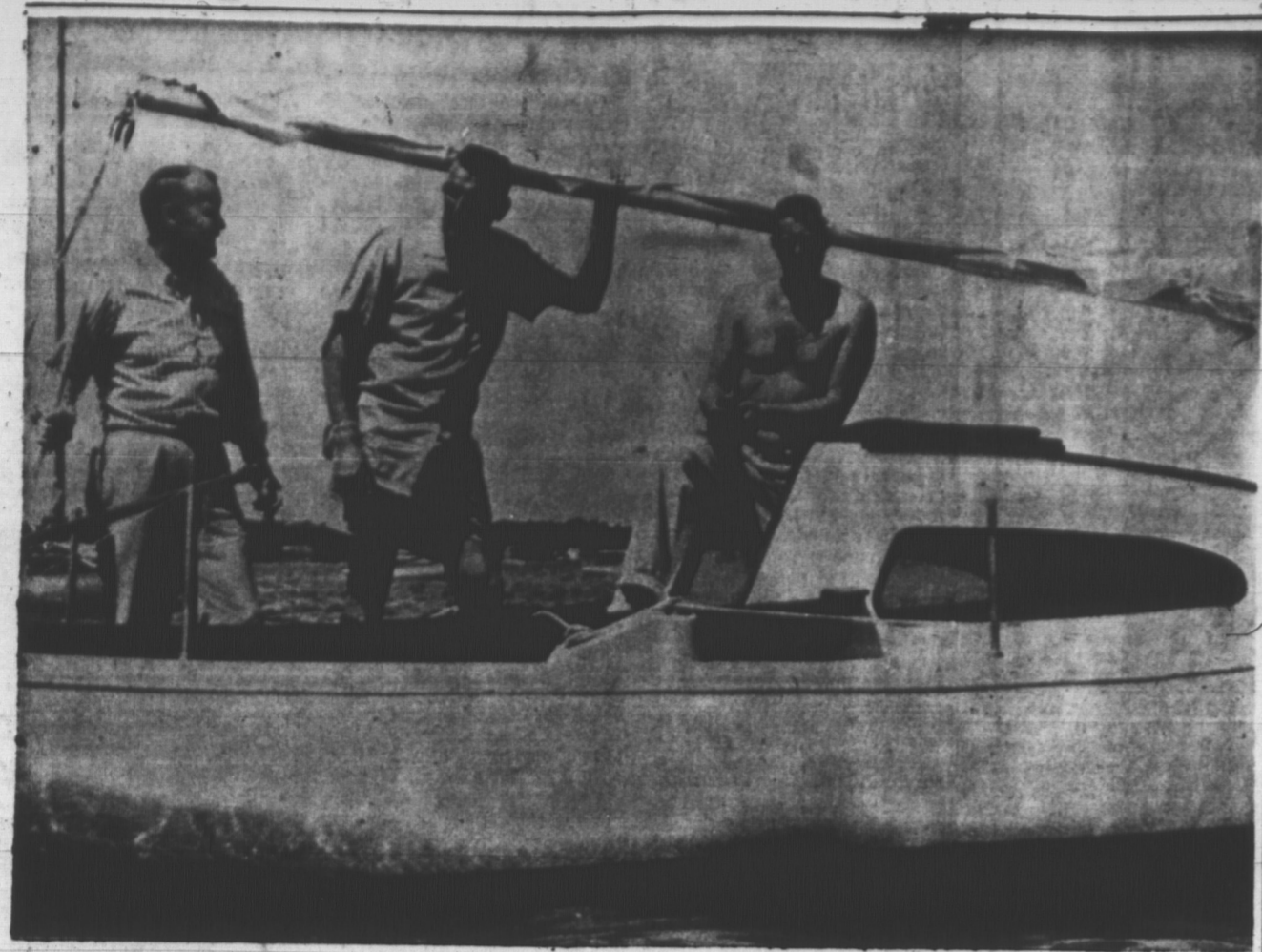
THE MERRY Mac II rests in Shediac Bay after a 25-hour run from Charlottetown. Merry Mac II was the winner of the Northumberland Strait Yacht Race on corrected time and captured the treasurer

ed Centennial Cup and the Carmon Dixon Trophy for being the first New Brunswick yacht over the line. The crew of the Merry Mac II is seen on deck waiting for the ten-