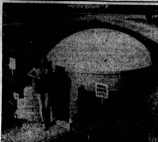
FAMILY FOXHOLE —Latest entry in the parade of home bomb shelters is this dome-roofed, concrete structure, which San Francisco builders say can be installed in your back yard for $1250. The 12½-ton house sleeps six comfortably or 20 in an emergency. When not in use as protection against aerial attacks, it doubles as utility room or guest house. The 14-inch-thick dome and eight-inch walls should be adequate protection from the weather.