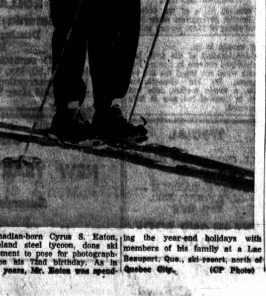
Canadian-born Cyrus S. Eaton, Cleveland steel tycoon, dons ski equipment to pose for photographers on his 72nd birthday. As in other years, Mr. Eaton was spending the year-end holidays with members of his family at a Lac Beauport, Que., ski-resort, north of Quebec City.