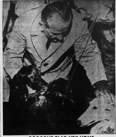
DOG-GONE GLAD HE'S HOME

Life insurance companies would get equivalent powers under their companies to invest in real estate before the committee and provincial trust companies already had them in many cases.