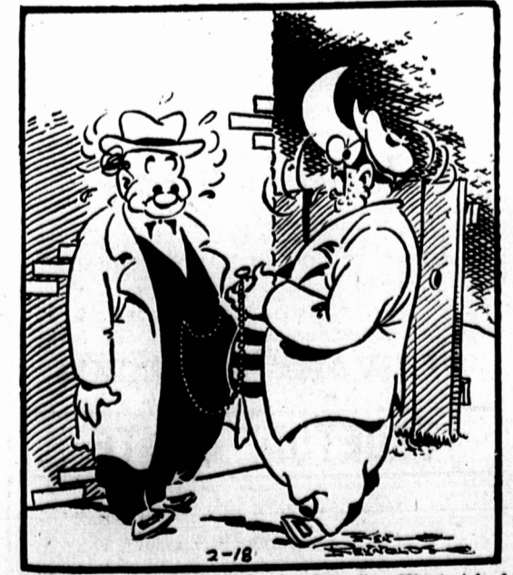
"Say, you better look in the Guardian Want Ads for a repair shop—your watch don't run!"