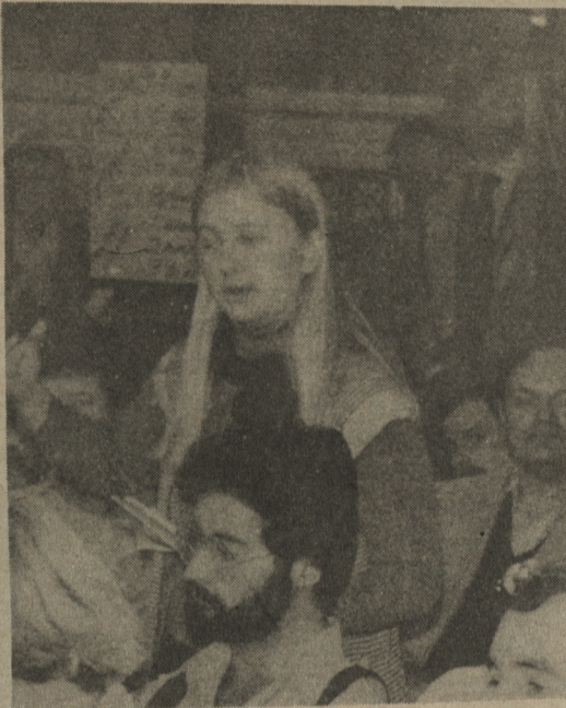
The candidate speaking her piece.