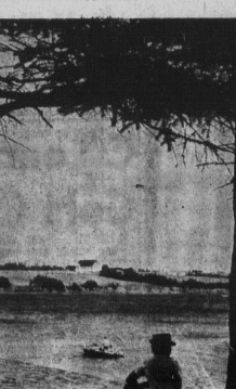
VIEW OF ST. PETERS BAY