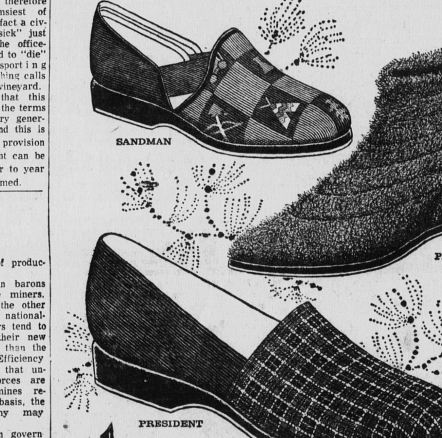
FOAMTHREADS—the gift of year-round comfort

What's the remedy for a man condemned to the city? He must relax, say the physicians. Gasling said that done, even if you