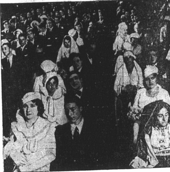
Famous among "mass marriages" are those held in Italy under sponsorship of Mussolini. Newlyweds who figured in a Rome wedding of 700 couples are pictured above in church.