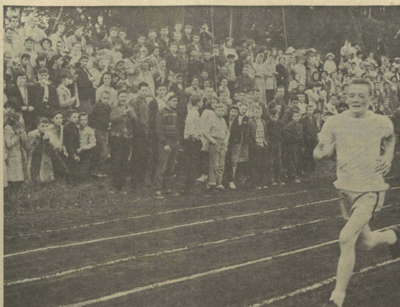
WINNING THE MILE