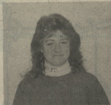
3. "I thought the panther was pretty good, but I don't know about the pink part."