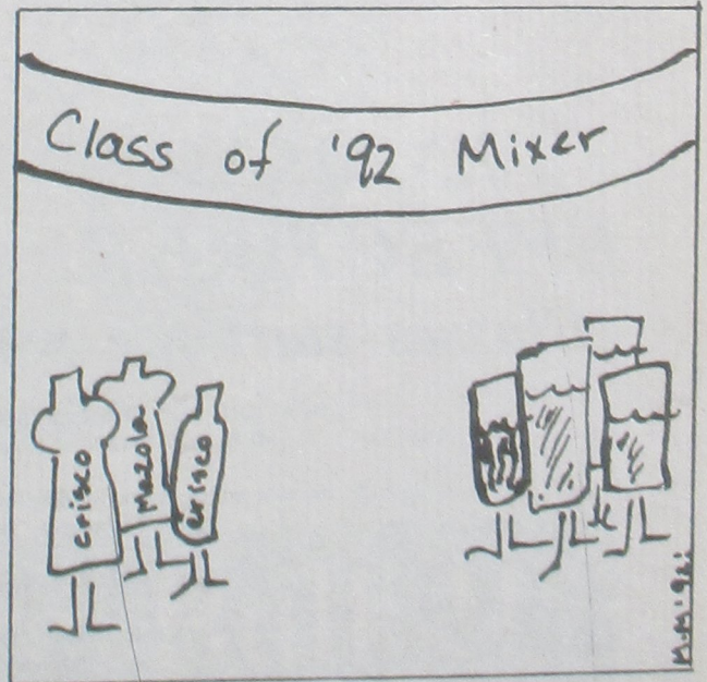
Oil and water don't mix