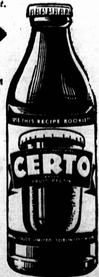
A Product of General Foods

The Canning & Preserving Season is Here For your requirements call at our store This is the height of the strawberry season. We can supply all your needs. MacGowan's Ltd. Kilmuir