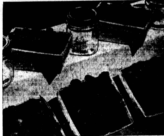
ENJOY BERRIES THE YEAR 'ROUND

In these modern times, such short-cuts as using commercial fruit pectin makes home preserving a real joy. Either powdered or liquid fruit pectin produces such sparkling, flavorful jams and jellies you'll never want to go back to the tedious, long-boil method. With the short boil method made possible by the use of commercial pectin, the actual boiling time for both jams and jellies is just one minute. Too, you use fruit at its peak of ripeness and goodness when the flavor is the fullest and best, and you get 50 per cent more jam and jelly from the same amount of fruit as with the old-fashioned method. For there's no need to concentrate the jam and jelly mixture to its right "jelling" consistency because you add the exact amount of pectin needed to produce the perfect "jam" or "jelly". But remember this, it is important to follow exactly the instructions that accompany these commercial pectins, using the exact amounts of ingredients called for in each recipe. Also it should be remembered that the recipes for powdered and liquid pectin are not interchangeable. You'll find a magnificent variety of recipes in the booklets that accompany each bottle or package of commercial fruit pectin.