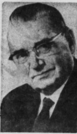
Hon. J. Angus MacLean