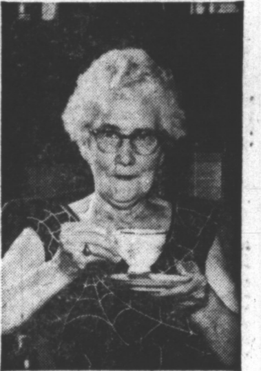
In Saint John