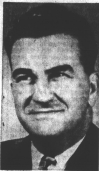
The Honorable J. Angus MacLean Minister of Fisheries