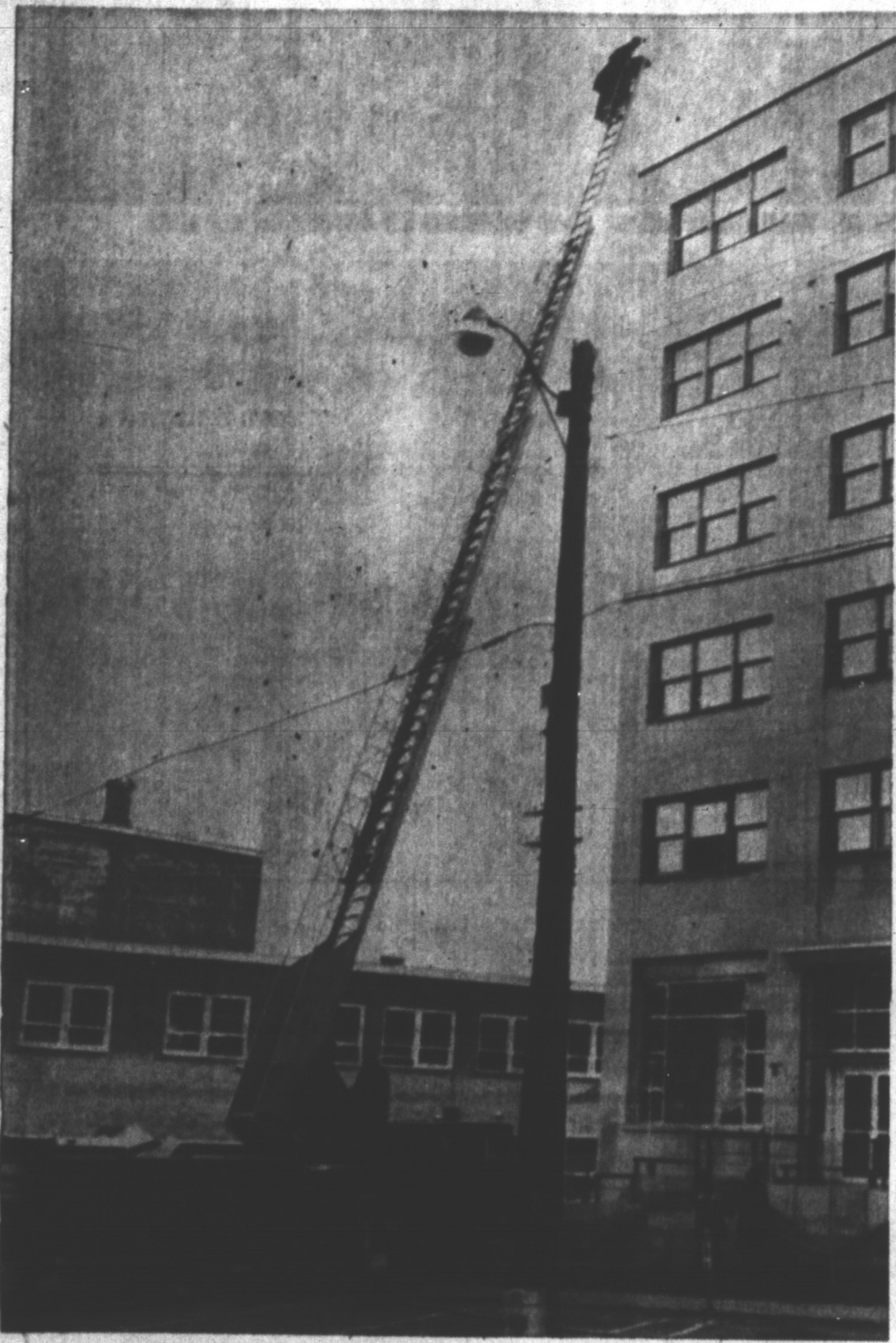
NEW LADDER CAN REACH TOP OF TALLEST BUILDINGS

The two biggest problems facing the department in the immediate future are the lack of sufficient water supply in some sections of the city and lack of space in the fire station. The first has been looked into by the water commission and improvements are to be forthcoming.