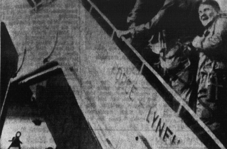
BRITISH TROOPS FLY TO CYPRUS

Soldiers of the 26th Field Regiment of the British Royal Artillery board a military plane at Lymcham, England.