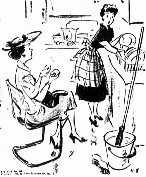
"I want my daughter to finish college so she'll have something to think about while she's doing her housework."