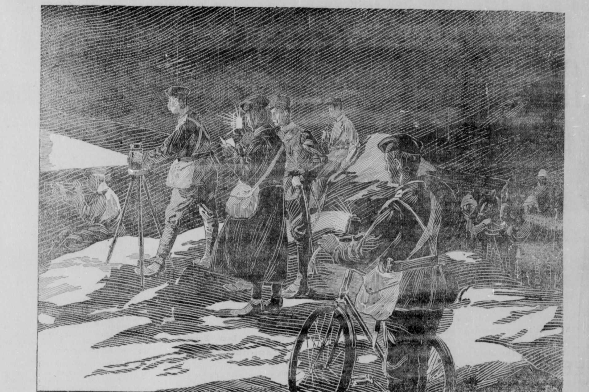
BRITISH SIGNAL CORPS ON DUTY.

BEER & GOFF Queen & King Square Grocers.