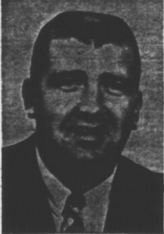
KIMBALL C. ACORN

SAVE HUNDREDS OF DOLLARS . . . NO GIMMICKS ALL CARS VALUED OVER $1000 CARRY THE KIMBALL C. ACORN USED CAR GUARANTEE.