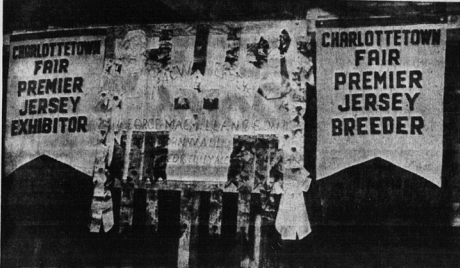
THIS SHOWMAN WON MORE THAN HIS SHARE OF PRIZES