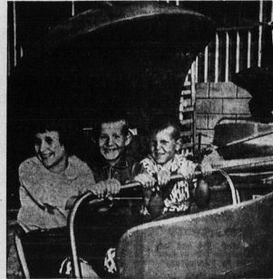
FUN ON THE RIDES

THE GUARDIAN - THE EVENING PATRIOT PAGE 5-A