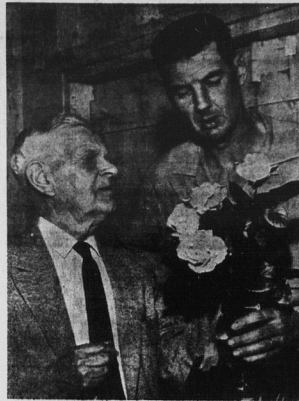
FLOWERS, TOO, IN LIMELIGHT