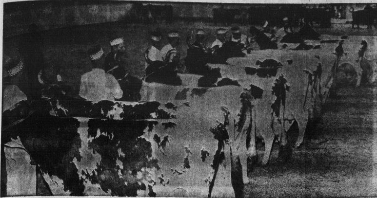
ANNUAL FAIR IS A SHOWCASE FOR THE ISLAND'S GREATEST INDUSTRY—AGRICULTURE

Sights of Old Home Week bring joy to hearts of young and make the old young again