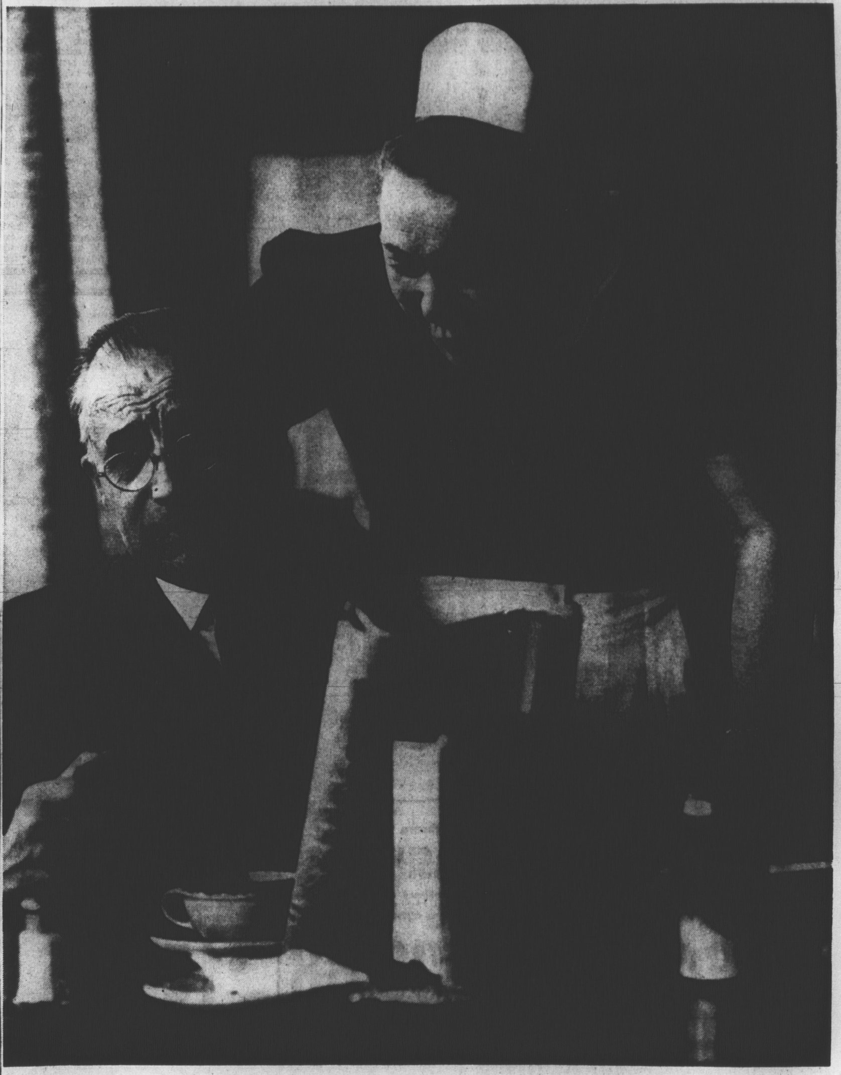
One thing about daily newspapers.