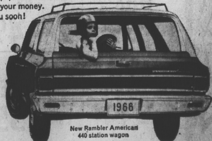
New Rambler American 440 station wagon

Let your Rambler dealer prove it to you soon!