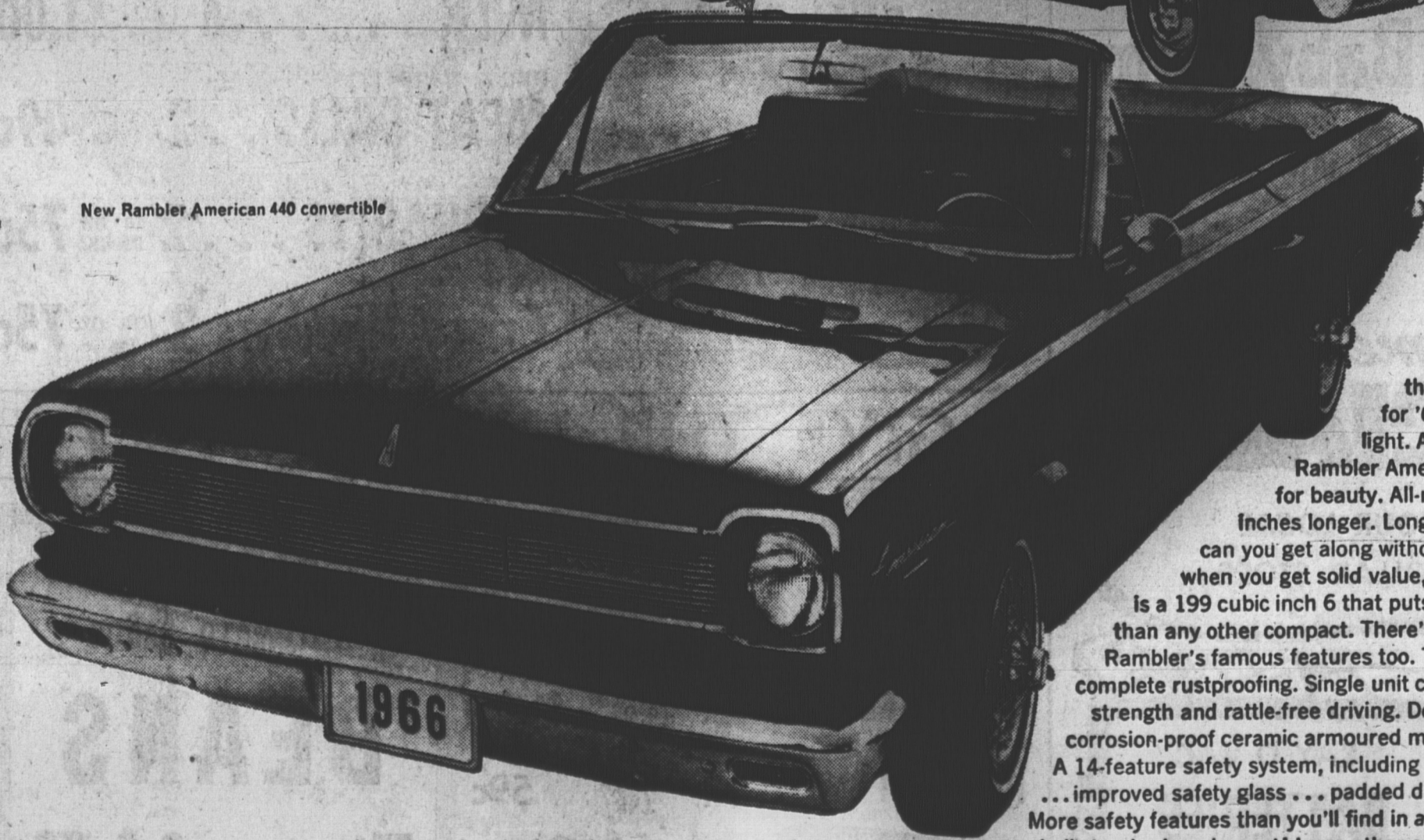
New Rambler American 440 convertible

The Rambler American is in the spotlight. Because it's all-new for '66. All-new from headlight to tail light. All new in styling inside and out.