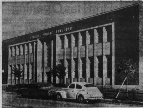
FEDERAL BUILDING FULFILLED A VITAL NEED OF CAPITAL