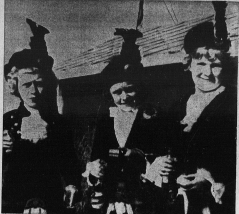
THE THREE shy and trimly dressed ladies above were caught and shot shortly after receiving their medals for