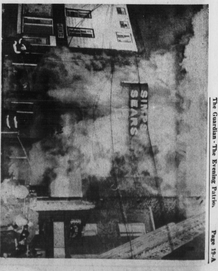
A FIRE AT SIMPSON'S SEARS RESULTED IN A LOSS OF $200,000