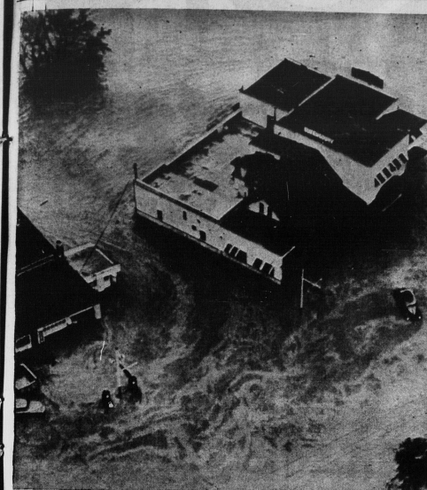
THE 1954 FLOOD in Toronto created by Hurricane Hazel caused about $24,000,000 in damage. This hotel and service station in Mount Dennis, a western suburb of Toronto, were partly submerged by water as the Humber River overflowed its banks.