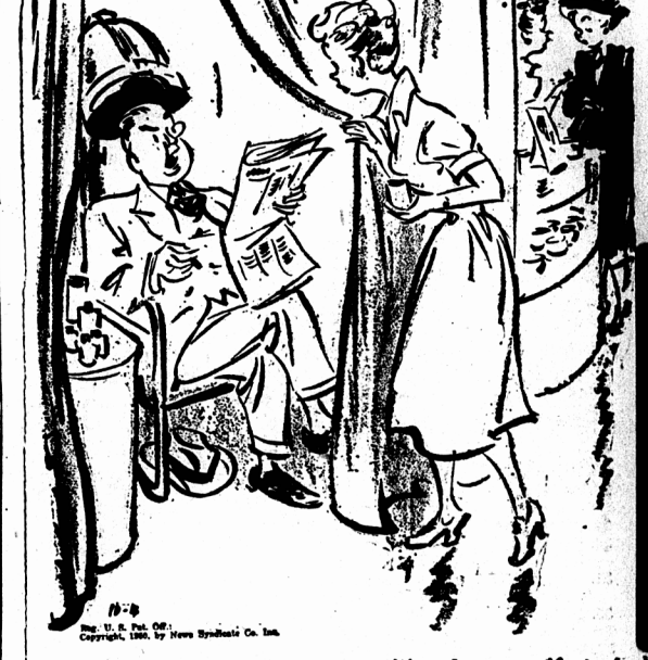
"I don't want a shampoo—I'm waiting for my wife to be finished."