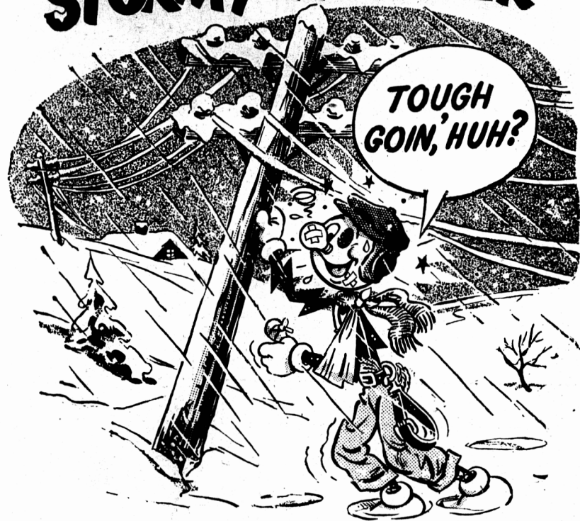
REDDY KILOWATT Your Electric Servant

I sure got the whole works this week, but -