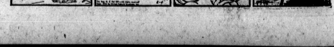
The Lone Ranger