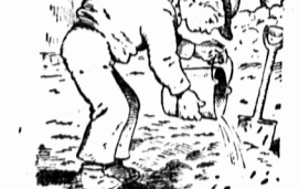
He mixed with it some of the mud from out back of the barn.

Day after day they worked. Some of the time Mrs. Swallow remained under the eaves while Muddy brought the pellets of mud for her to put in place. They were building with the greatest of care. Meanwhile, Farmer Brown's Boy took care that that mud-pie should not dry out. Now and then he added a little water to it. And as they worked the little feathered masons twittered contentedly for they were truly happy. That nest was going to be the finest one they ever had built.