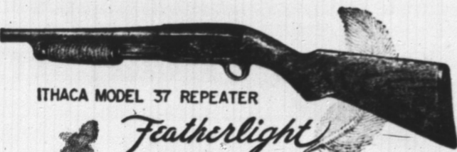
ITHACA MODEL 37 REPEATER