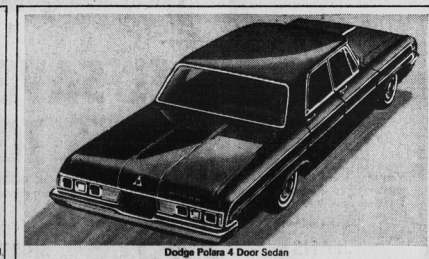
Dodge Polara 4 Door Sedan