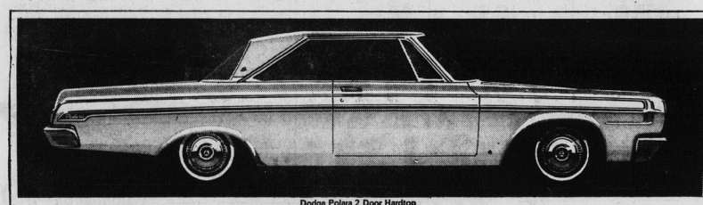
Dodge Polara 2 Door Hardtop

By THE CANADIAN PRESS SATURDAY National League Detroit 1 Toronto 2 American League Baltimore 2 Springfield 4 Buffalo 1 Hershey 4 Quebec 2 Pittsburgh 5 Providence 5 Cleveland 3 Central League Omaha 6 Indianapolis 4 St. Louis 5 Minneapolis 5