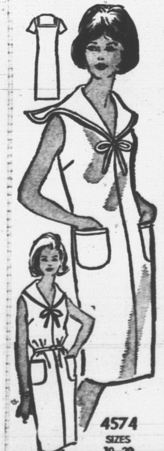
4574 SIZES 10-20 by Anne Adams

Up the creek whence comes our west wind, and along the stream up the valley to the north, wildings of trees now bloom: the pear in ragged flowers, the cherry blossoms so fragrant and neat.